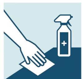
Keep objects and surfaces clean

Call your doctor again if you are getting worse. Call back if you are having trouble breathing. Do what your doctor says.